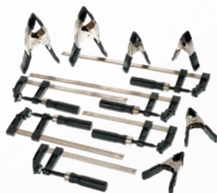
CR5105 F-Clamp Starter Box

Quick-adjust column drill table clamp - Attaches to almost any drill press table, a 3/8" opening in the table is all that is needed - 4 1/2" high capacity