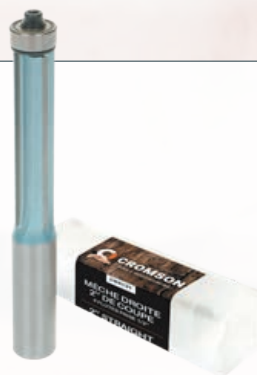
CR5131 2" Straight Router Bit 4 Flutes 1/2" Shank

Top and bottom bearing 2" straight bit - Perfect bit for squaring, following patterns and trimming wood - 2" cutting length - 3/4" diameter - 1/2" shank - micro grain carbide