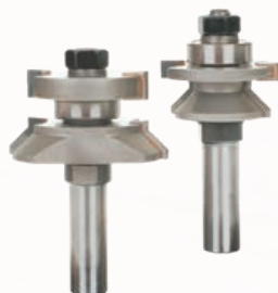
CR5134 Flooring Assembling Set with V

Perfect for squaring edges on any kind of wood - Exceptional finish and durability on all kinds of wood - 2" cutting length - 1/2" shank, micro grain carbide