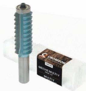
CR5130 Multi V Router Bit 1/2" Shank

Adds a decorative V edge or easily joins wood up to 2" thick - 1/2" shank - micro grain carbide