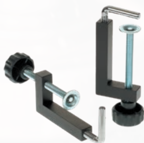
CR5103 Adjustable Fence Clamps (2PC/SET)

Perfect for holding disposable fence boards for rabbeting or cutting