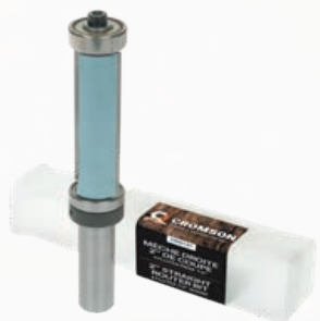
CR5132 2" Straight Router Bit Double Bearing 1/2" Shank

Adds a decorative V edge or easily joins wood up to 2" thick - 1/2" shank - micro grain carbide