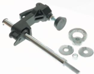
CR5104 Drill Press Hold Down

Perfect for holding disposable fence boards for rabbeting or cutting