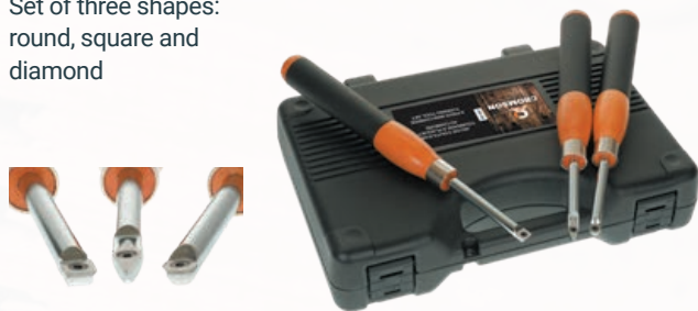
CR5110 3pc Carbide blades for Mini Turning Tool Set CR5109

13" Features a replaceable and rotating cutter - Designed for turning small pieces - Handles are turned from fine solid ash - Set of three shapes: round, square and diamond